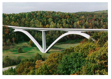
Natchez Trace Parkway Bridge

of the first routes for colonists who had settled west of the Appalachians and wanted to reach the Mississippi River. It has now become a popular drive between Nashville and Natchez, Mississippi.