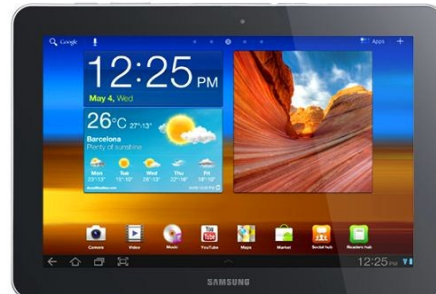
Samsung Galaxy tablet