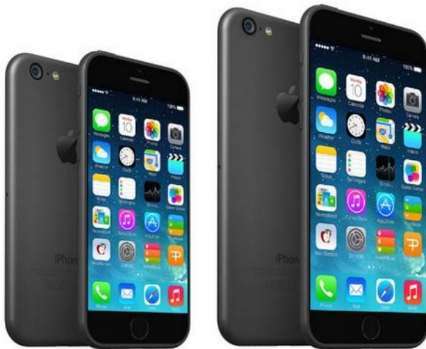
iPhone 6 (left) and iPhone 6 Plus (right)

While the iPhone 6 is certainly loaded with all sorts of great features and improvements over prior iPhones, the Samsung Galaxy S5 and LG G3 are still worthy competitors.