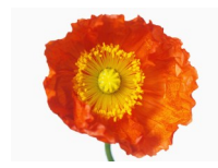
Flowers of Shakespeare