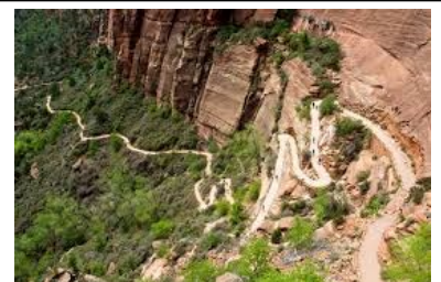
Angel's Landing Trail, Zion

Endless Wall Trail - New River Gorge National River, Cadillac Mountain - Acadia National Park, Kilauea Iki Trail - Hawaii Volcanoes National Park, Hoh River Trail - Olympic National Park, Ramsey Cascades - Great Smoky Mountains National Park, The Narrows - Zion National Park, Bright Angel Trail - Grand Canyon National Park, Angels Landing - Zion National Park, Upper Geyser Basin - Yellowstone National Park