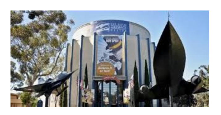
San Diego Air and Space Museum